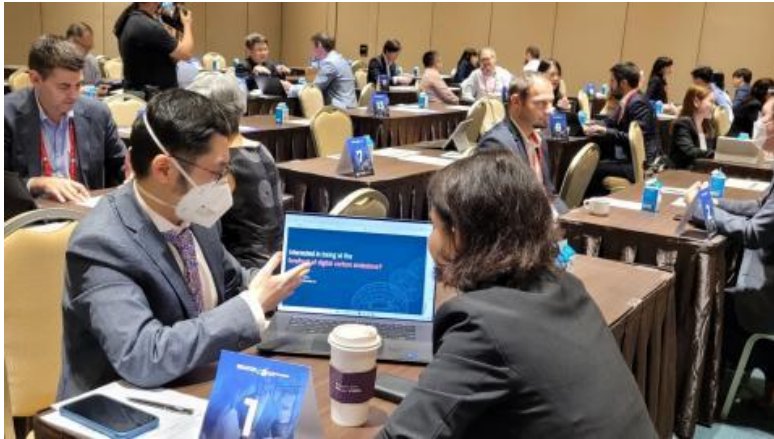
ECCP Matchmaking in Singapore

On 26-27 September, the Agency held the Eighth European Cluster Conference in Prague attended by more than 500 people from 40 countries. The conference included a matchmaking event, an exhibition and side events. A successful European Cluster Collaboration Platform ( ECCP ) matchmaking event took place in Singapore on 18-20