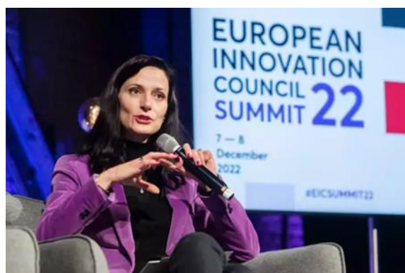
EIC Summit: Photo Credit ©European Union

EIC Summit: On 7-8 December, the EIC held its flagship one-and-a-half-day event in Brussels, organised by EISMEA. Combining plenary sessions, award ceremonies and workshops, the event included 90 speakers and attracted almost 1200 participants. In the EIC exhibition area, 20 EIC-funded projects presented their innovative services and products. The event saw the adoption of the EIC Work Programme 2023 , the presentation of the EIC impact report 2022 , and the nomination of new EIC Ambassadors .