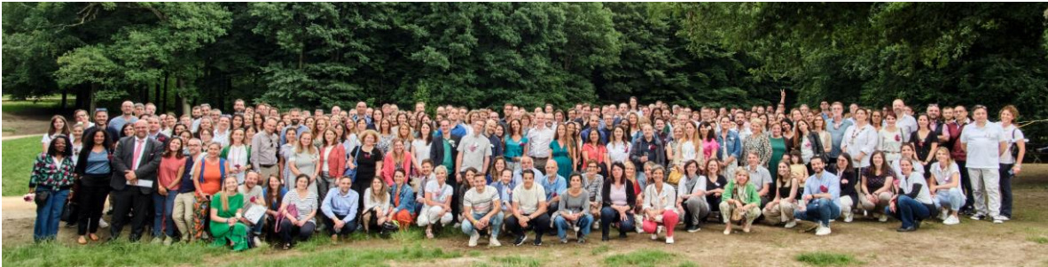
EISMEA Away Day - June 2022

Building up a vibrant and inclusive working environment: EISMEA held its first Agency Away Day gathering more than 370 colleagues for activities with a focus on EISMEA’s six values. The agency continued its support of bottom-up initiatives with the creation of a football team as well as specific groups on cycling, greening and mind & body. Events to commemorate the Czech presidency, EISMEA’s first anniversary and St Nicolas further helped to bring staff together in person.