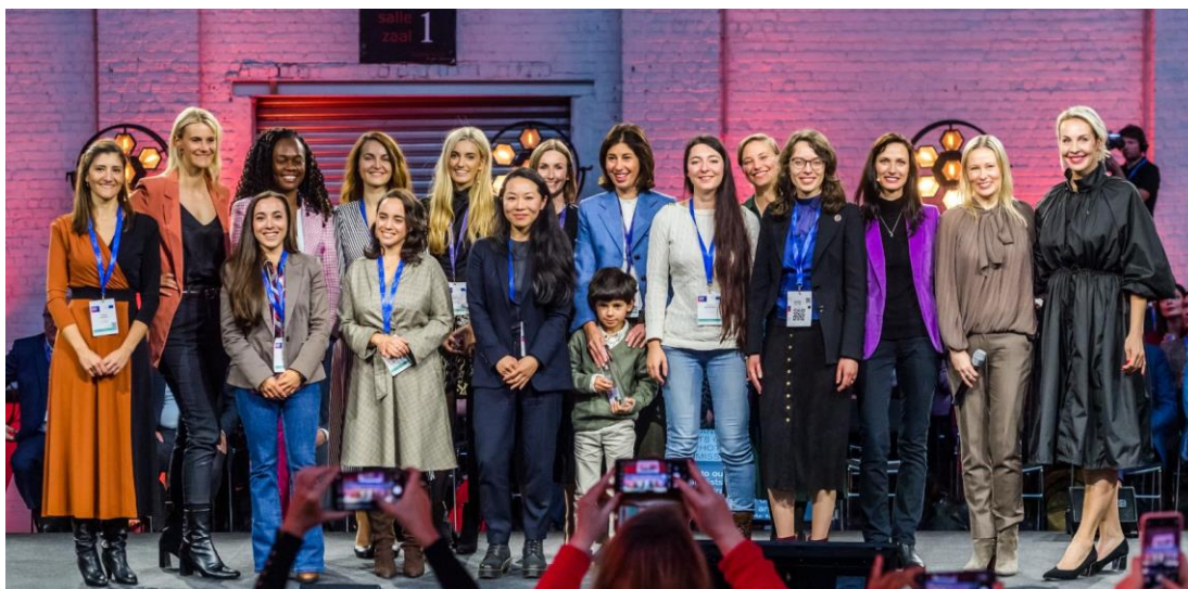
EU Prize for Women Innovators

facilitate sharing knowledge and good practices. Three meetings took place and 15 cities have already joined it.