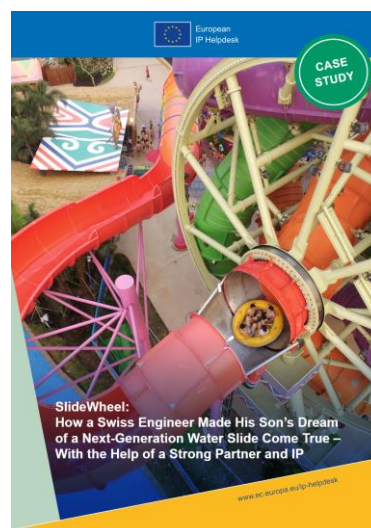
IPR helpdesk in action

Legacy activities: EISMEA continued implementing activities launched under Horizon 2020, notably grants and contracts related to the Innovation in SMEs programme (Innosup). Published results included: a report on experimentation in innovation agencies , a handbook of service design by and for European innovation agencies , a report on segmentation along lifecycle and sectors and an update report on supporting cluster facilitated projects to build new industrial value chains .