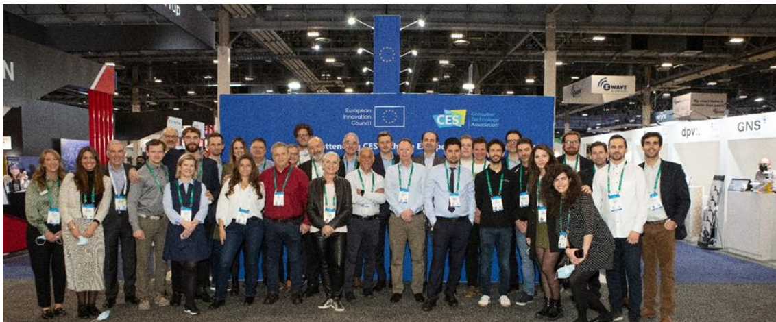
EIC Pavillion at CES 2022

Events: In 2022, EISMEA brought 120 SMEs to six trade fairs, including CES, BIO and FIME in the USA, Arab Health and Gitex in Dubai and Medica in Dusseldorf. CES Las Vegas showed record results with the 18 participating beneficiaries citing EUR 24,6 million of expected business, 19 jobs created and 71 more expected.