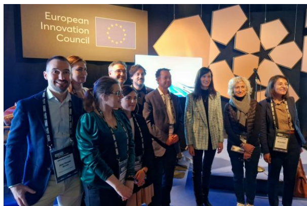
EIC at Slush (Helsinki)

Participation at major international events: The EIC was present at major innovation and deep-tech related events, including VivaTech in Paris (15 June) where EIC sponsored the Next Unicorn Awards; Sifted in London (5-6 October) where the EIC Fund was introduced to the vibrant London deep-tech investor community; Web Summit in Lisbon (1-4 November) and Slush in Helsinki (16-17 November) where EIC partnered with EIB to have a more ambitious presence including a large stand to host workshops.